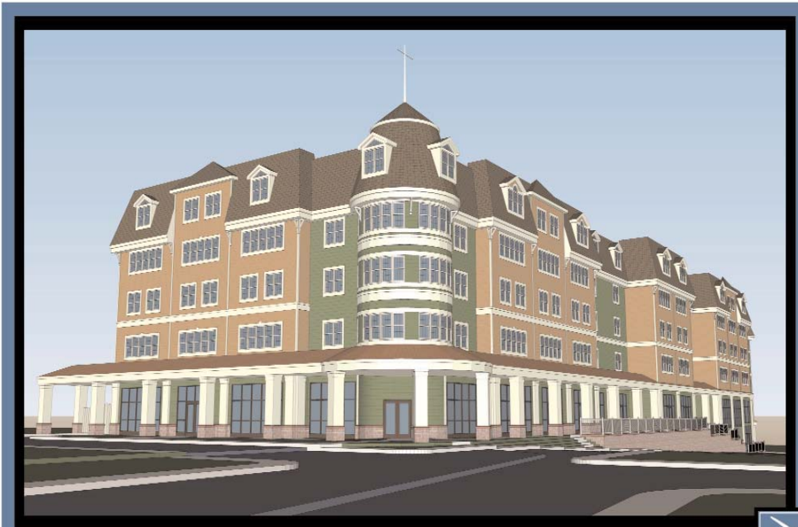
VIEW FROM MAIN STREET